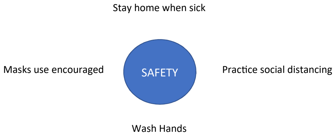
Table 3 - Basic COVID-19 Protection

These basic measures that can be taken to reduce risk of COVID-19 transmission are presented in the diagram below.